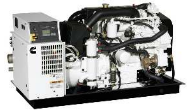
Standard model without sound shield and with Cummins Onan Digital Display shown