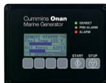
Cummins Onan Digital Display