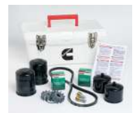
Cummins Onan Cruise Kit