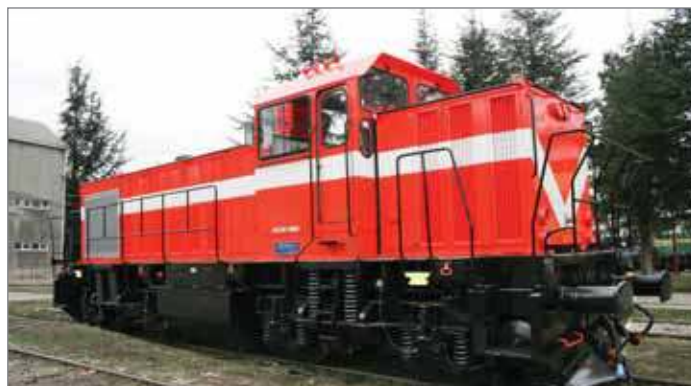
Cummins 38L powered switcher in Turkey