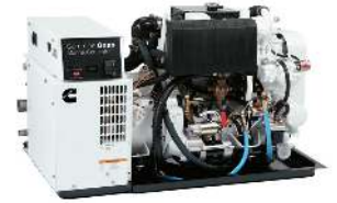
Standard model without sound shield shown