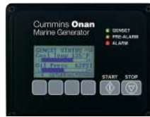
Cummins Onan Digital Display