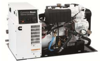
Standard model without sound shield shown