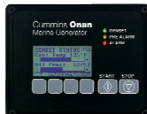
Cummins Onan Digital Display