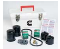
Cummins Onan Cruise Kit