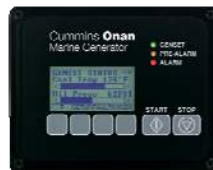
Cummins Onan Digital Display