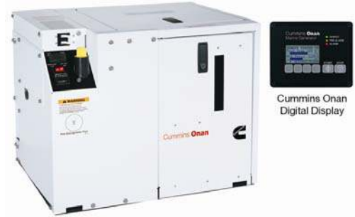
Cummins Onan Digital Display