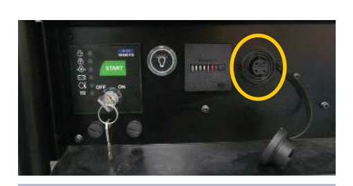
Technic 6500 E AVR (MODYS option)