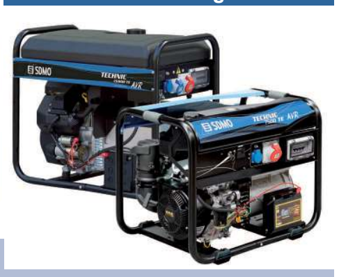
Technic 7500 TE AVR (MODYS option) Technic 15000 TE AVR C Technic 20000 TE AVR C