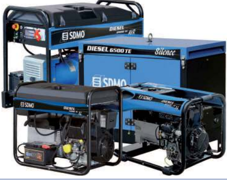
Diesel 6500 TE Silence Diesel 6500 TE XL C (MODYS option) Diesel 15000 TE XL C Diesel 20000 TE XL AVR C Diesel 15000 TE Silence