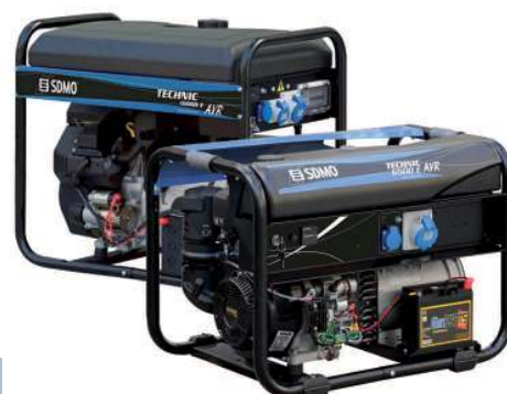
Technic 6500 E AVR (MODYS option) Technic 10000 E AVR C

Three phase gensets equipped with MODYS control unit :