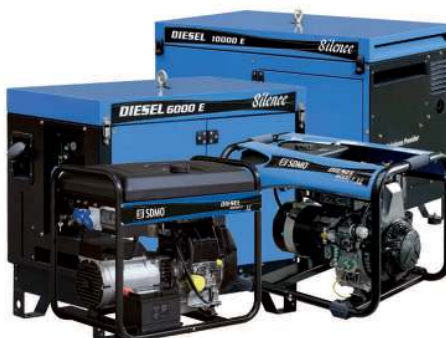
Diesel 6000 E Silence Diesel 6000 E XL C (MODYS option) Diesel 10000 E XL C Diesel 10000 E Silence