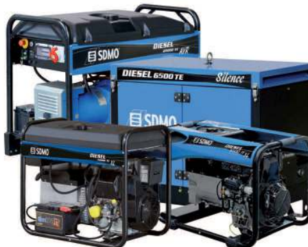
Diesel 6500 TE Silence Diesel 6500 TE XL C (MODYS option) Diesel 15000 TE XL C Diesel 20000 TE XL AVR C Diesel 15000 TE Silence