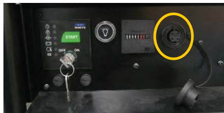
Technic 6500 E AVR (MODYS option)