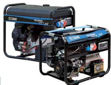
Technic 7500 TE AVR (MODYS option) Technic 15000 TE AVR C Technic 20000 TE AVR C